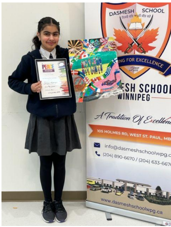
Above: 1st and 2nd place From Dasmesh School West St. Paul (MB)