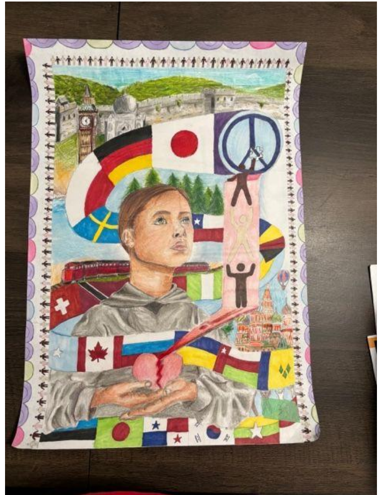
5M11- 1st Place