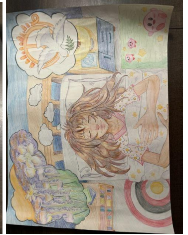
2nd West St. Paul