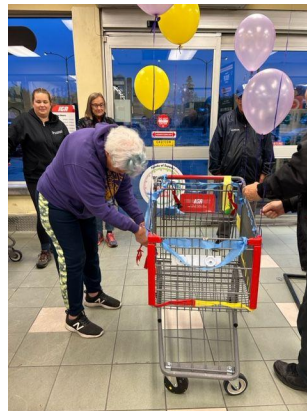
Decorating shopping cart