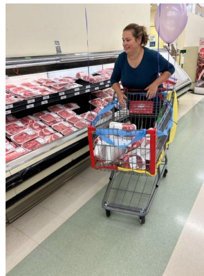
Daughter running to get as many groceries in 5 minutes