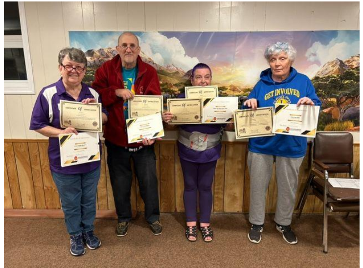
West St Paul (MB) LIONS