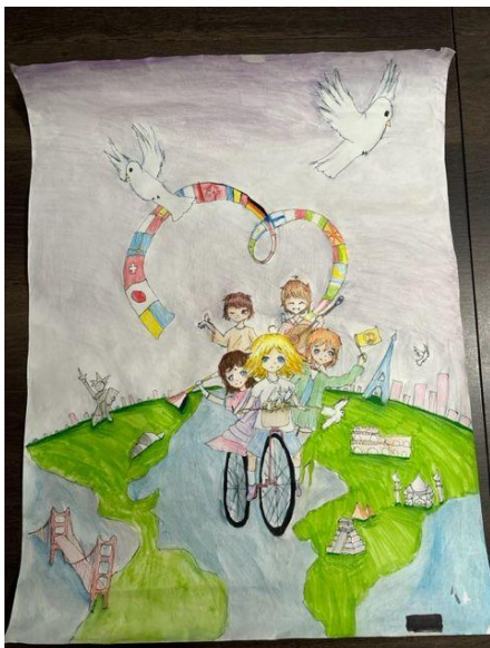
2nd - Ralph Brown