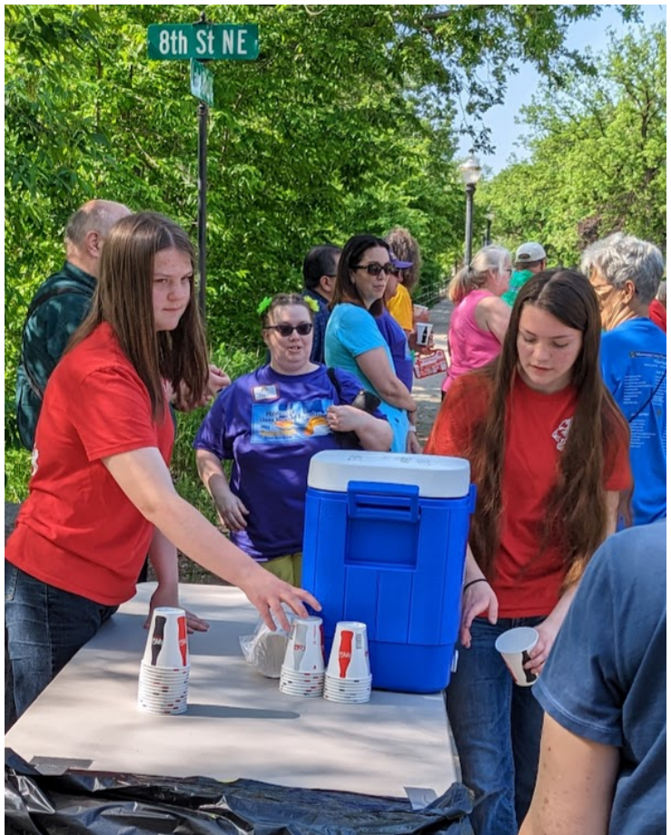
Members of the Dilworth-Glyndon-Felton Leos managed the water station for the MN Lions Hearing Foundation D-Feet walk held June 3 at Diamond Point Park in Bemidji, MN.