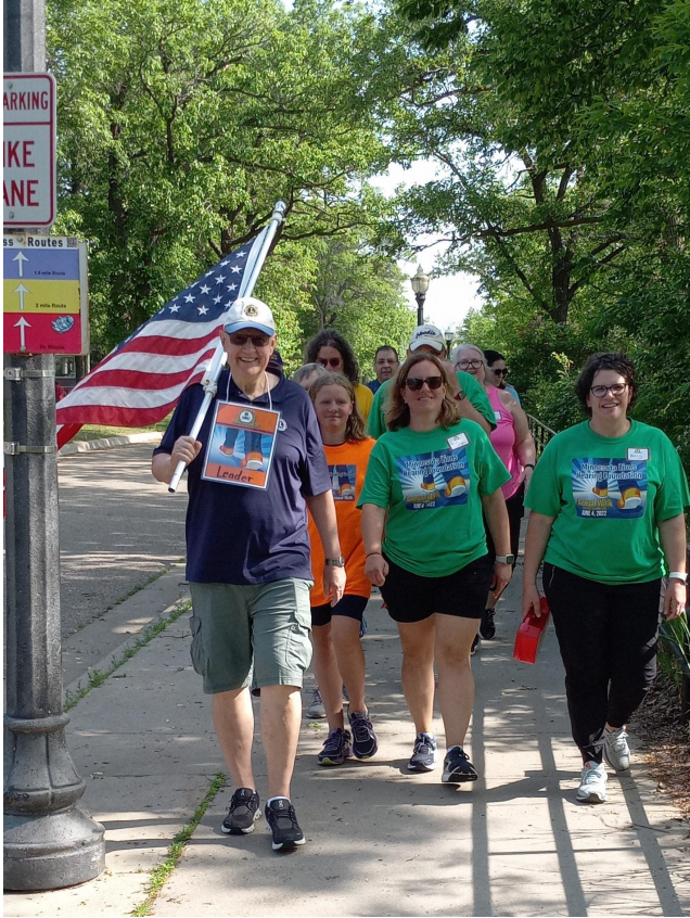
Above: Participants on the walk along Lake Bemidji