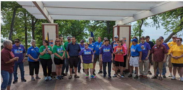
Pictured are some of the participants for the 2nd annual MN Lions Hearing Foundation D-Feet walk held June 3. Proceeds from the event benefit programs sponsored by the hearing foundation.

Why don't I see any pictures or articles about my club in the Newsletter? The likely reason is that we didn't receive any.