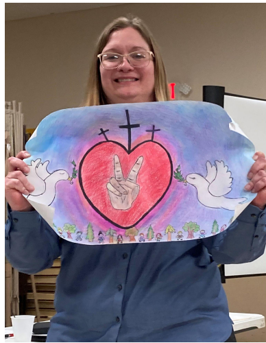
below: CLUB REPORTS