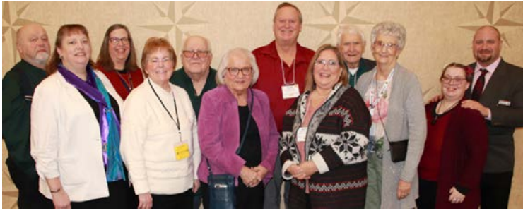
DILWORTH & DILWORTH LOCO LIONS