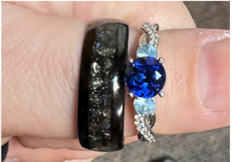
THE RINGS !!!