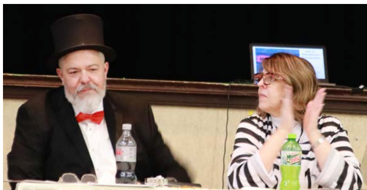
"RICH UNCLE PENNYBAGS"