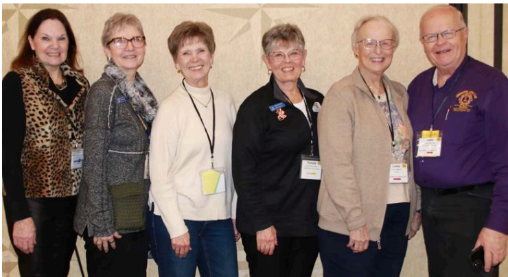
THIEF RIVER FALLS LIONESS LIONS & CROOKSTON LIONS