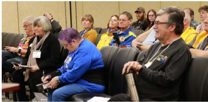
Above: Attendees at the meeting