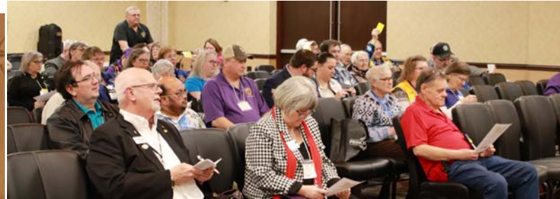
Below: Random Photos

Clubs were asked to bring personal hygiene items as well as hats, gloves and scarves