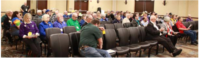
Above & Below: Attendees