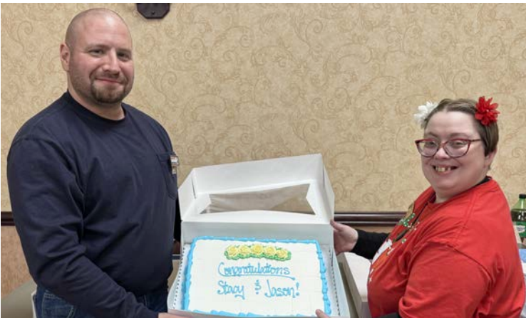
Cake was later shared in the hospitality room