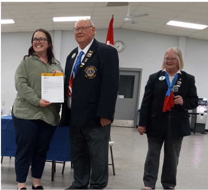
Above: Chevron for years of service with Moorhead Lions