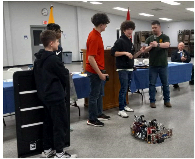
The DGF Robotics Club demonstrated how their robot works. They won the state competition and will be competing in the World Competition in Texas, this month. Two DGF LEOS are on the Robotics Team.