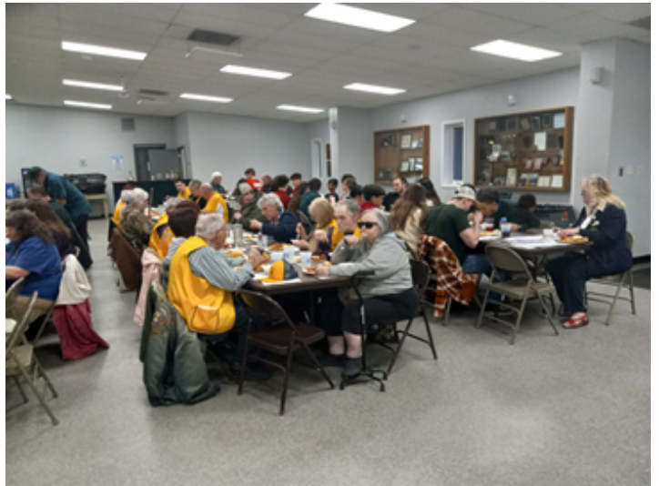
Dilworth, Dilworth Loco, Glyndon, Moorhead, Fargo Gateway Lions & DGF LEOS enjoying the evening on March 14th (above)