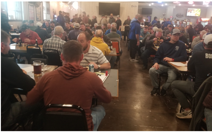
Another full house greeted the Barnesville Lions as they sponsored their 24th Sportsmen's Stag. It would be number 26; however, in 2021 and 2022 the club did a raffle because of the Covid Epidemic.