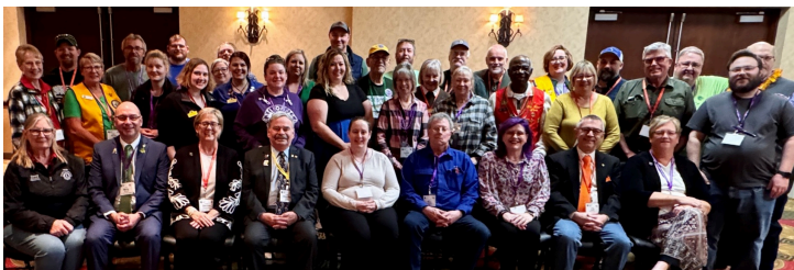
ELLI PARTICIPANTS FROM AROUND THE MULTIPLE, MARCH 15-17 IN MAHNOMEN