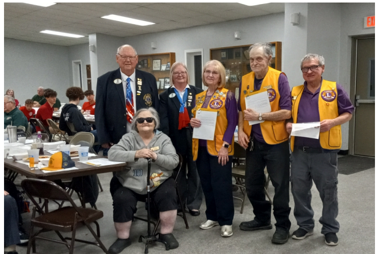
Glyndon Lions receive chevrons for various years of service