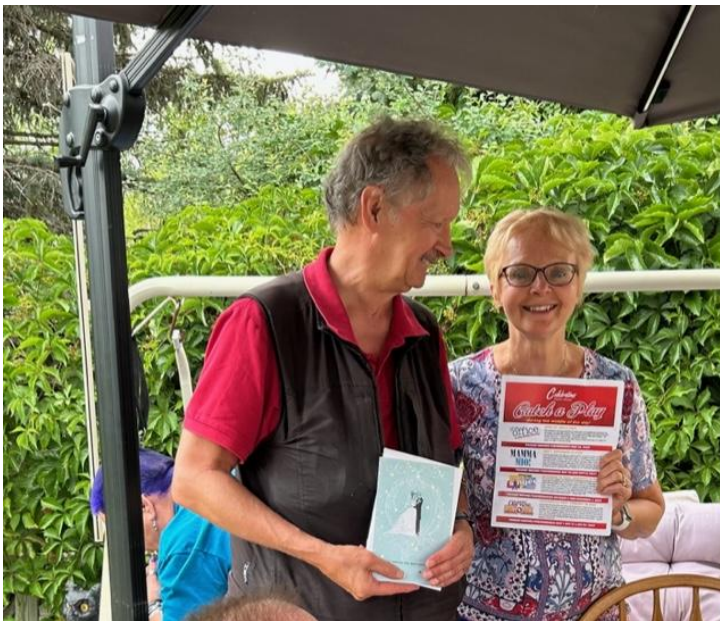
5M11 needs you to become a Vice District Governor!