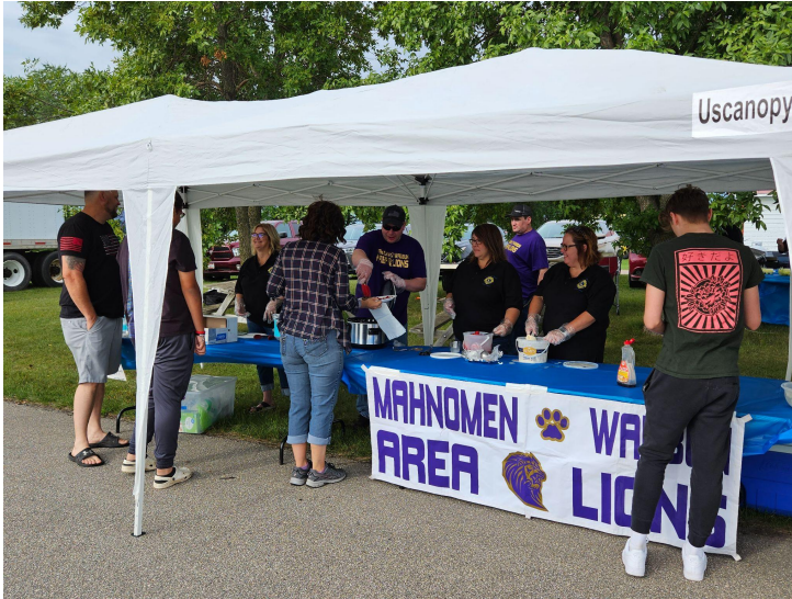
MAHNOMEN WAUBUN AREA LIONS FLY-IN BREAKFAST