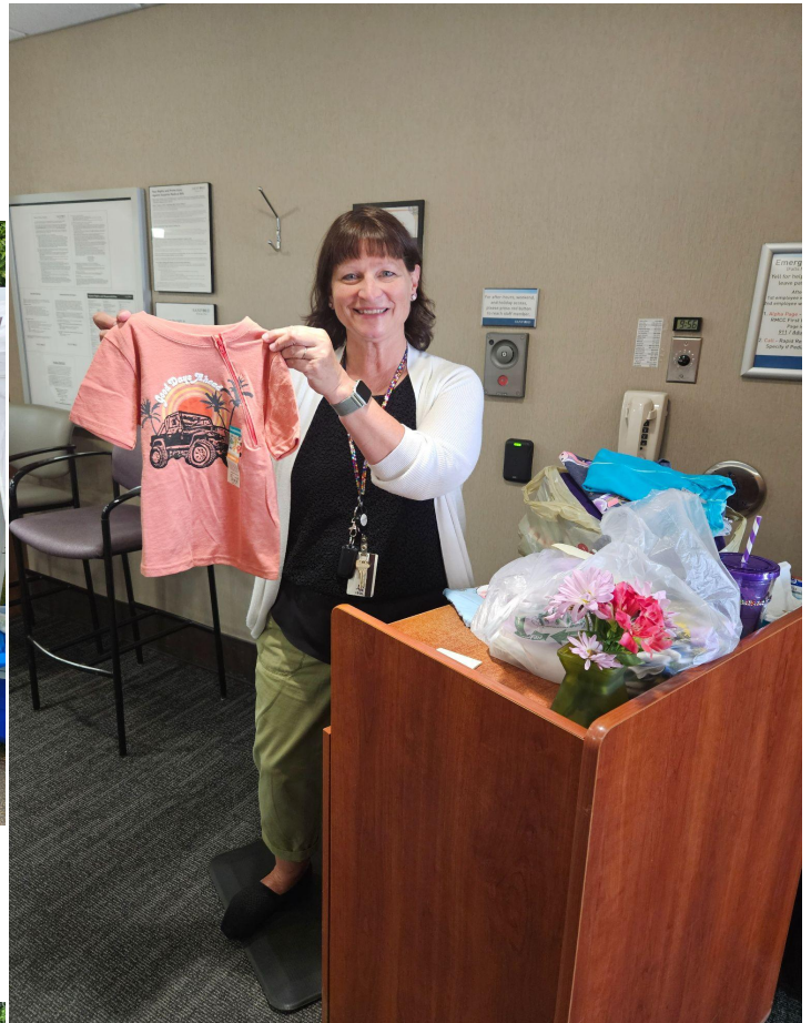
HITTERDAL LIONS DELIVER 30 CANCER SHIRTS TO THE ROGER MARIS CANCER CENTER IN FARGO, ND