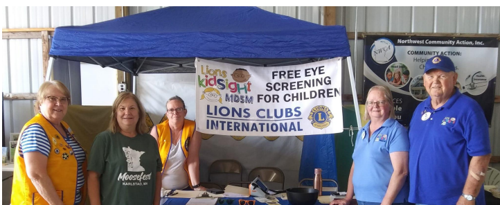
Above: Karlstad Lions held a KidSight screening at the Kittson County Fair in Hallock.