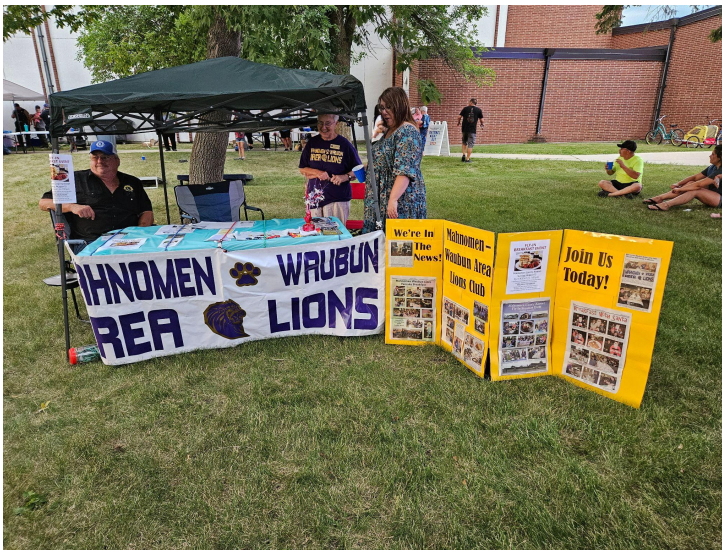
The Mahnomen Waubun Area Lions at a table at Mahnomen National Night Out.

Below: The Canine Unit did a demonstration.