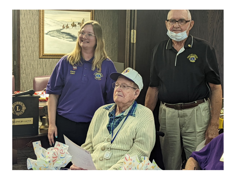
Above: Fosston-Lengby Charter members honored