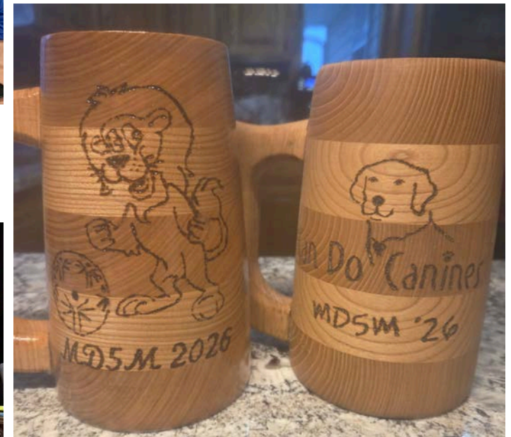
2026 MD5M convention mugs made by Lion Mark Spielman.. Can Do Canines mug raised $600.00 for them.. The MD5M mug raised $1,000.00 for LCIF.